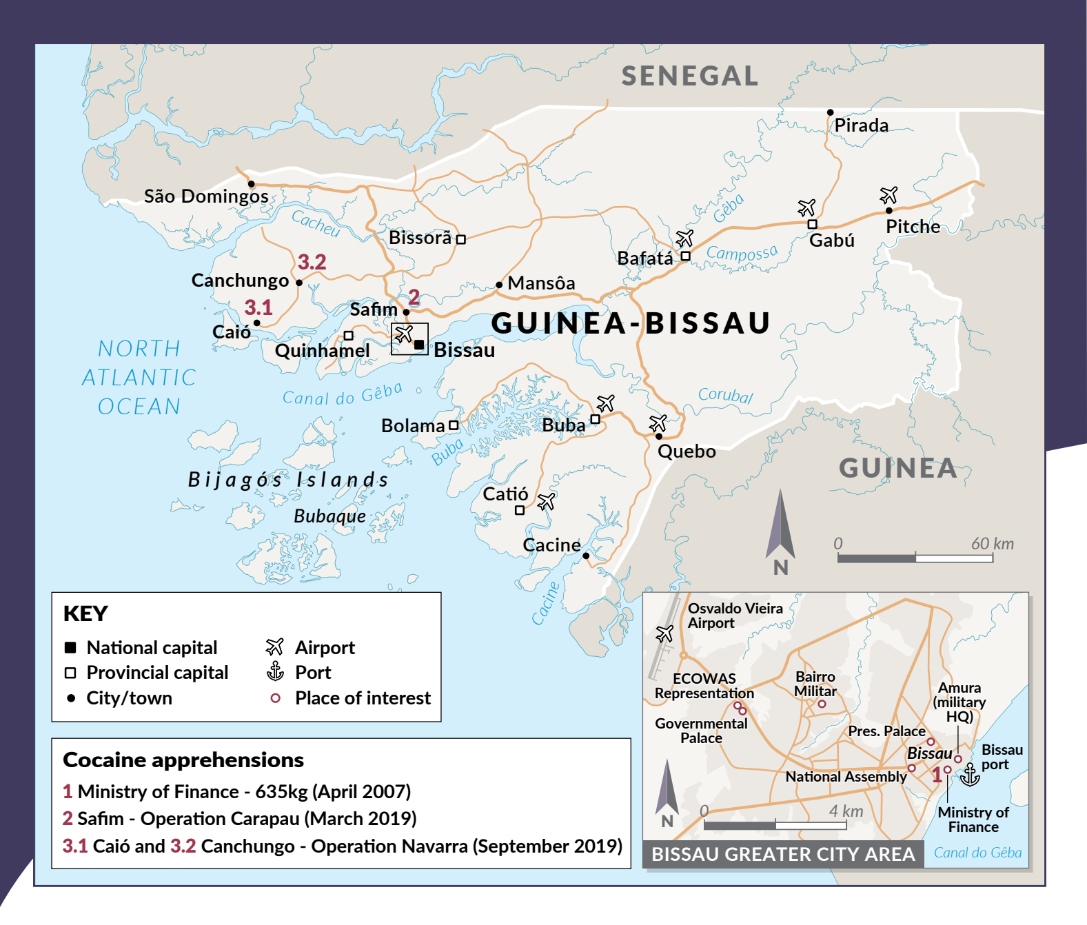
FIGURE 1 Guinea-Bissau

Whatever the case, the cocaine economy and the local profits it has generated, largely from protection fees paid to some in the political elite, but also the resources it provides to a wider network of actors, including many young men, have become deeply entrenched in the political and societal life of the country.<sup>3</sup> This has damaged the political process by resourcing political and military bureaucrats, and their supporters in the military and the justice system, whose primary aim is to misuse political office for personal gain.