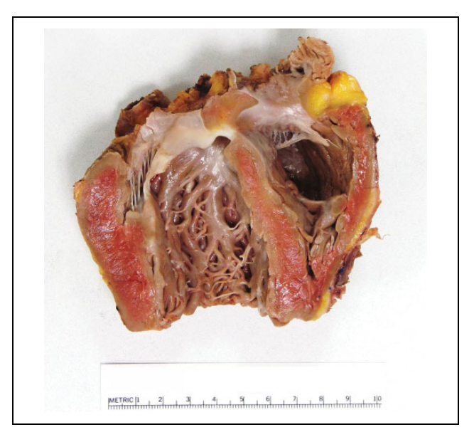
Figure 2. The explanted heart demonstrates mild left ventricular dilatation, without septal hypertrophy or gross fibrosis. Both the atria and the cardiac apex are surgically absent.

The heart weighed 275 g following LVAD removal. Gross examination revealed mild dilatation of the